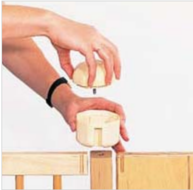
Our post-and-ring connector system is childproof and tool-free!