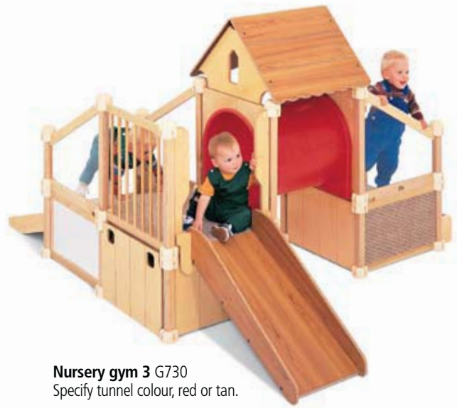
Nursery gym 3 G730 Specify tunnel colour, red or tan.

These compact nursery gyms offer age-appropriate physical challenges, such as stairs, slides, and inclined ramps.