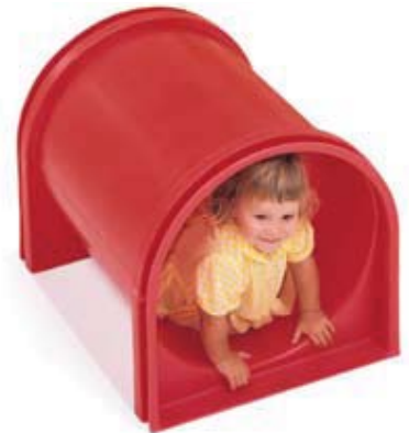
Red Nursery gym tunnel G752 Tan Nursery gym tunnel G753 50 cm x 62 cm The tunnel can also be used on the floor with or without the nursery gym.