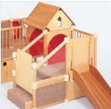
Removable gates let you close the whole gym or just the slide.