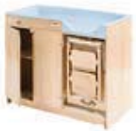
Changing table with steps, 10 cm pan G261