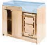
Changing table with steps, 15 cm pan G268