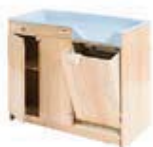
Changing table w/o steps, 10 cm pan G241